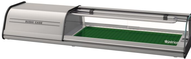
VSU 4 P