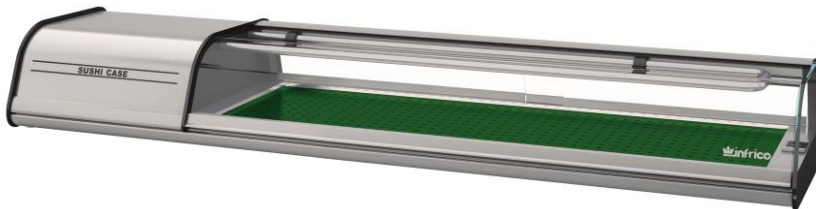
VSU 6 P